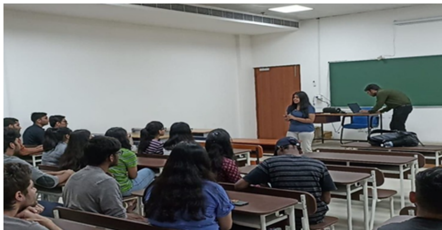
Students sharing their Experience of Rajasthan in 'Rajasthan ki Baat'